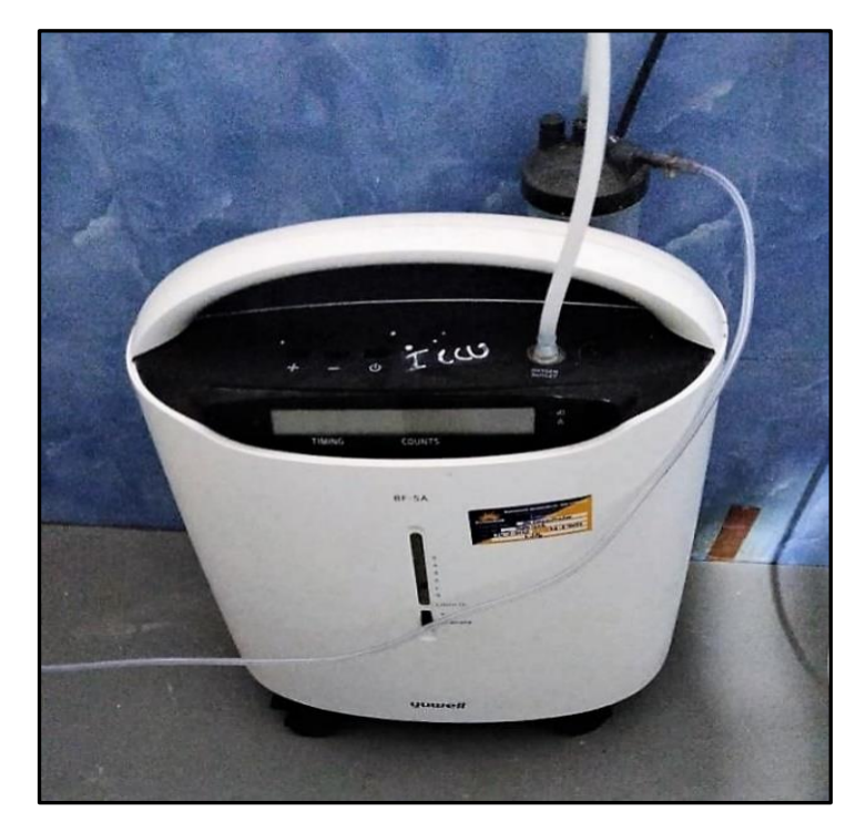
Oxygen Concentrator at Government Hospital Periyakulum, Theni, Tamil Nadu